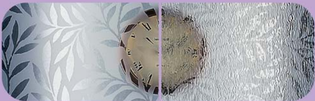
Pilkington Oriel Laurel™