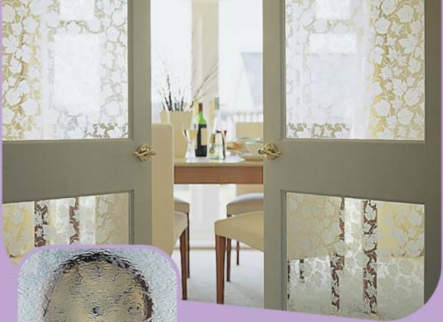
Pilkington Oriel Coppice™