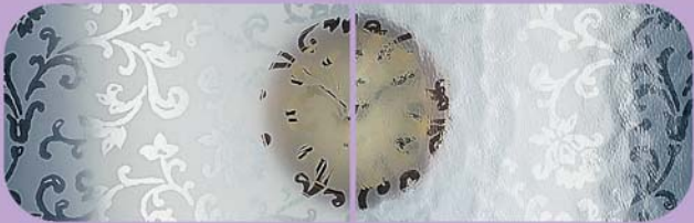
Pilkington Oriel Brocade™

With a superb range of designs, together with diffused glass options for each design, this premium range of etched glass adds a touch of style and elegance to your home.