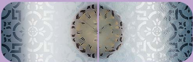
Pilkington Oriel Canterbury™